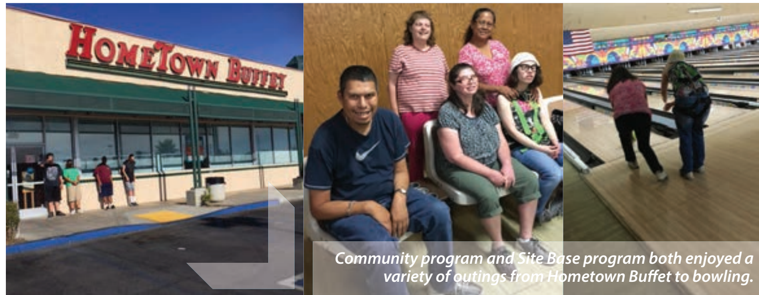
Community program and Site Base program both enjoyed a variety of outings from Hometown Buffet to bowling.

Who we are PROGRAM PHILOSOPHY The overall philosophy of PBMC for its service is to increase our individual's capacity for greater independence, enhance self-responsibility, improved communication skills and improved overall health. Personal growth in all these important areas will result in the individual being productive members of society to the best of their abilities. COMMUNITY VOLUNTEER: We believe in motivating our individuals to want and achieve more independence through our volunteer program. Individuals are encourage to volunteer out in the community, understand responsibilities of work ethics and have a meaningful life. Our individuals are trained in communication, organizational skills, money management, decision making, socialization, mild behavior management, and job preparation. Our volunteers are taught to be team players and are encourage to become independent and part of society. Through positive belief our individuals will increase confidence to succeed.