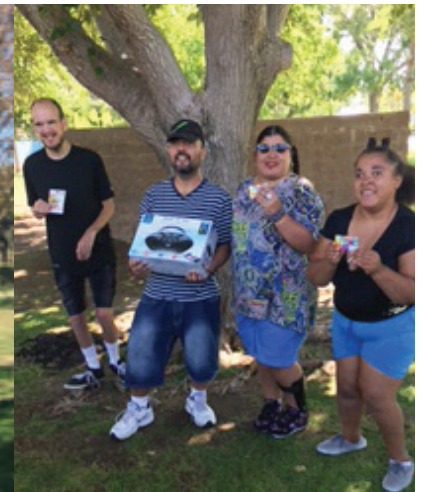
Our site base program took a trip to Marie Kerr Park to participate in a game of kickball!

Our site base program took a trip to Marie Kerr Park to participate in a game of kickball! Site base also decided to end the summer participating in a couple of days of water play.