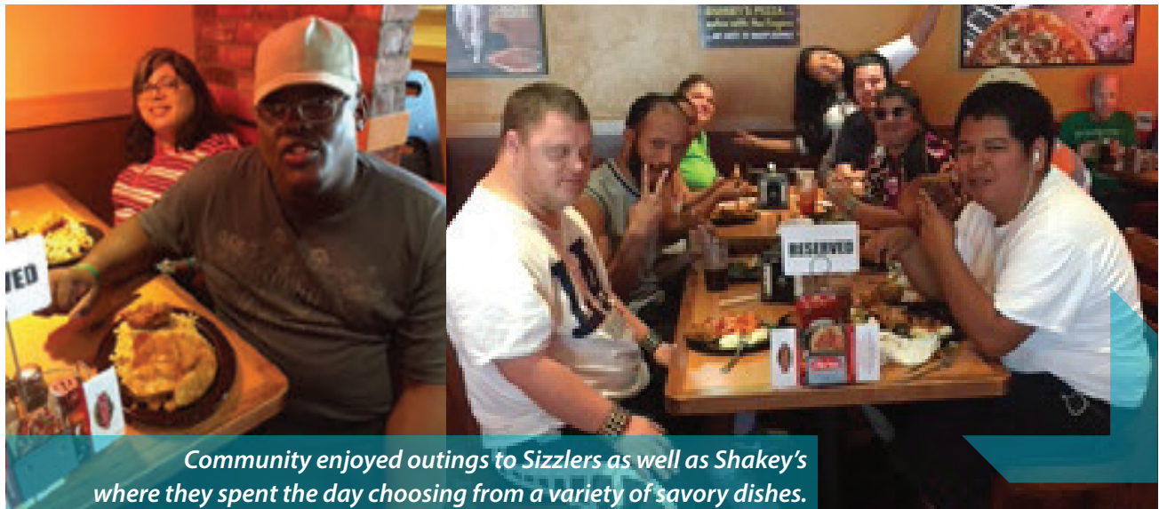
Community enjoyed outings to Sizzlers as well as Shakey's where they spent the day choosing from a variety of savory dishes.

Our community program was excited about their monthly outings and all of the great foods that came along with it. But more than that, the unforgettable memories gained this month is all that count.