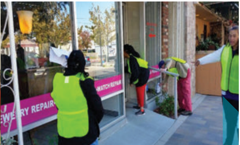
Volunteer work is incorporated into daily activities which include window washing and adopting a highway