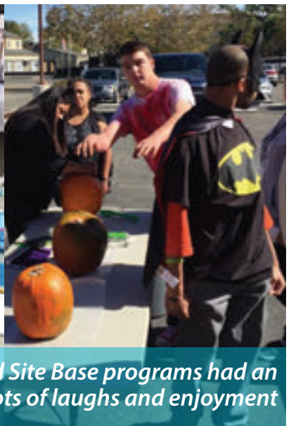
Our Community and Site Base programs had an unforgettable celebration with lots of laughs and enjoyment