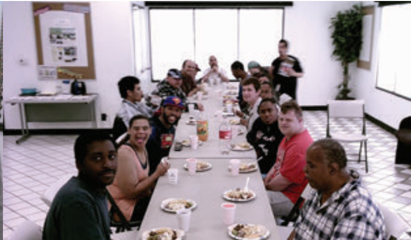
This month at PBMC we celebrated Thanksgiving with plenty of delicious food and laughs