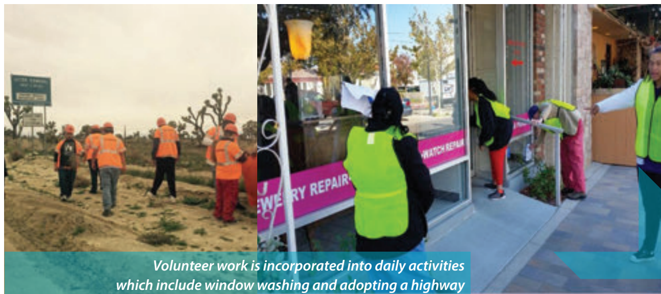
Volunteer work is incorporated into daily activities which include window washing and adopting a highway

Volunteer work is always incorporated into the daily activities; window washing and adopting a highway is just a couple of things on this month's productive itinerary.