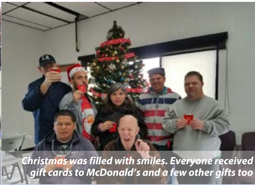
Christmas was filled with smiles. Everyone received gift cards to McDonald's and a few other gifts too