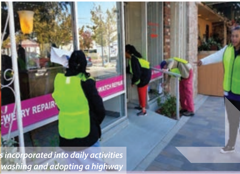
Volunteer work is incorporated into daily activities which include window washing and adopting a highway