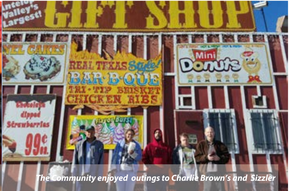
The Community enjoyed outings to Charlie Brown's and Sizzler